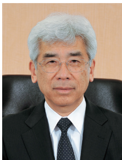
Dean, Course of Biomedical Sciences